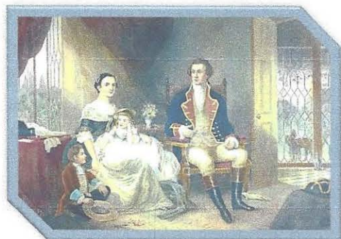
The George Washington Courtship of Martha began March 16, 1758