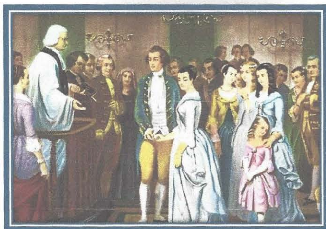
The Marriage of George and Martha Washington January 6, 1759