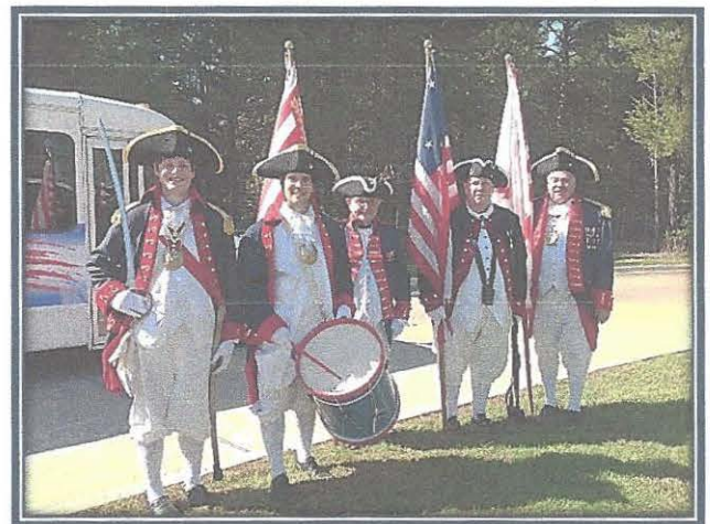
The Color Guard presented the colors at the Watkins-Logan Veteran's home on Veteran's Day.