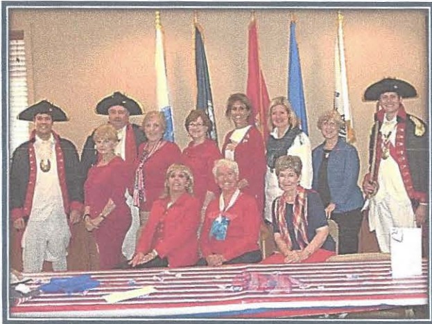
SAR and DAR combined to help serve the Veterans at the Watson-Logan Veteran's Home on Veteran's Day.