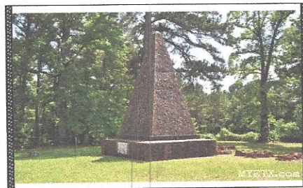
Killough Massacre Monument