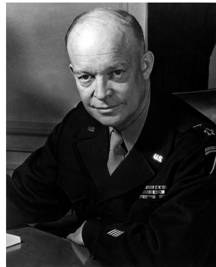
President Dwight D. Eisenhower