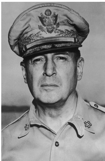
General Douglas MacArthur