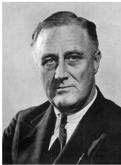
President Franklin D. Roosevelt