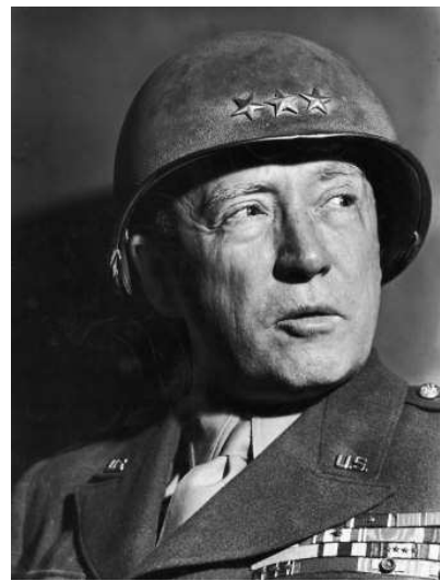
General George S. Patton