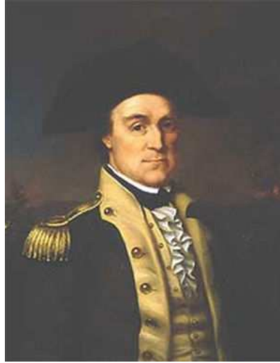
Elijah Clarke (1742-1799)