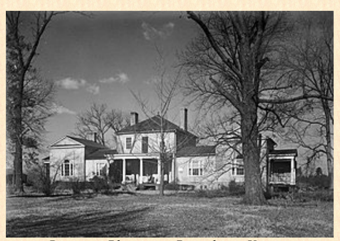
Battersea Plantation, Petersburg, Virginia

The son of John Banister and grandson of John Baptist Banister the naturalist, he was educated at Middle Temple in London, England, admitted on September 27, 1753. Banister served in the House of Burgesses (1765–1769, 1772–1775), Virginia House of Delegates (1776–1778, 1781–1784), and Second Continental Congress (1778–1779). While a delegate to the Continental Congress, he was a framer of the Articles of Confederation, which he signed on July 8, 1778. Banister also had served as a member of the Virginia Convention, which declared Virginia an independent state in 1776. He was appointed the first mayor of Petersburg in 1785. He was well informed on current affairs and an established writer.