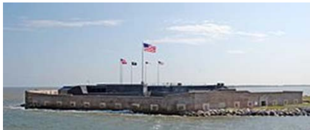
Restored Fort Sumter today

Commercial boat tours of the area are available today, and both forts have been restored. The area is administered by the National Park Service. Both the Park Headquarters and Fort Moultrie are located at 1214 Middle Street on Sullivan's Island and are accessible by car.