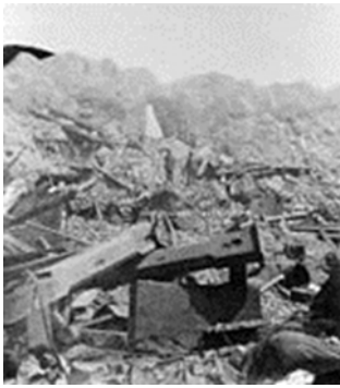
The Union began trying to retake Sumter in 1863. This is an interior picture of the fort in 1864