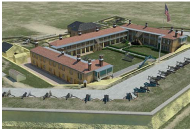
Fort Moultrie restored to Civil War era condition today

11, 1861, when the South Carolina militia demanded surrender of the Fort. At 4:30 a.m. on April 12, the Confederates began a 34-hour siege of Fort Sumter, which began the Civil War.