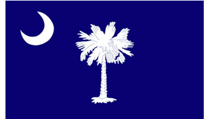
The flag of South Carolina State today

palmetto tree was honored by the State of South Carolina. It is today known as the Palmetto State. The