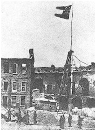
Confederate Flag inside Fort Sumter in 1861

The problem was lack of bedrock under the proposed fort. The satellite picture clearly shows the huge sandbar halfway across the harbor. Large rocks had to be shipped from northern states. South Carolina declared secession from the United States on December 20, 1860. On December 26, U.S. Army Major Robert Anderson, without authorization from Washington, secretly moved two companies of men from Fort Moultrie to unfinished Fort Sumter. Less than half of the cannons were in place, and little ammunition was available. An impasse continued until April