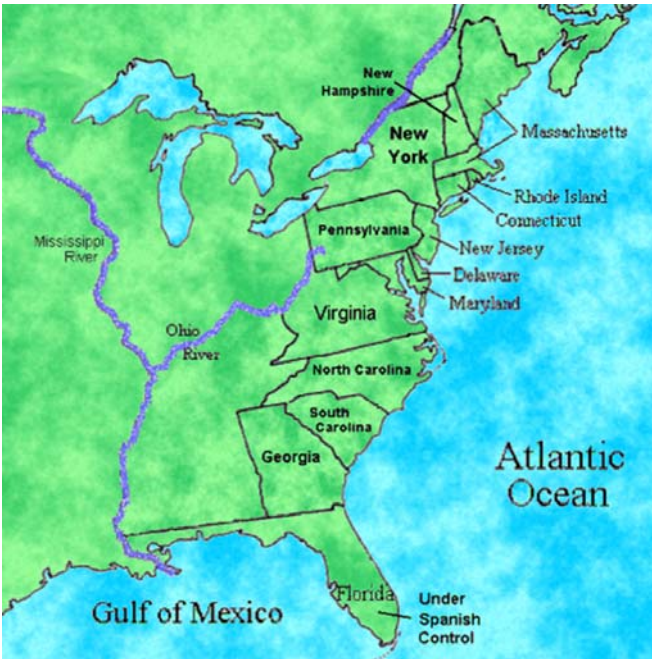
The 13 States

General George Washington, Commander in Chief of the Continental Army, had his hands full with the British in the northern colonies, mainly Southern Massachusetts to New Jersey. He appointed General Nathaneal Greene as Commander (with full power) of the Southern Army, from Delaware to Georgia.