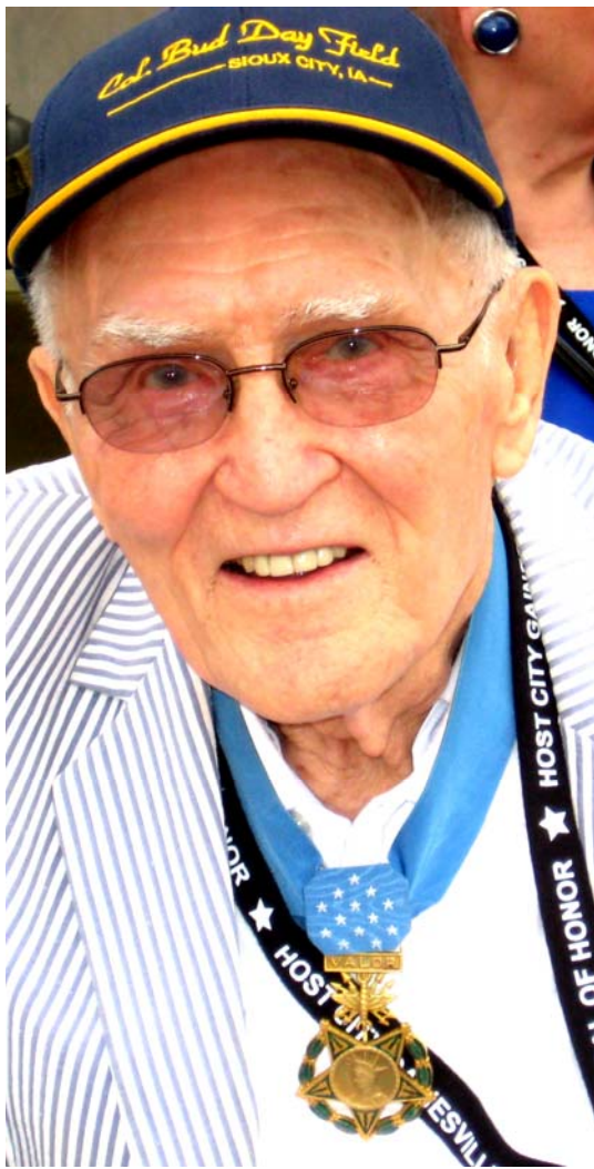
George E. "Bud" Day