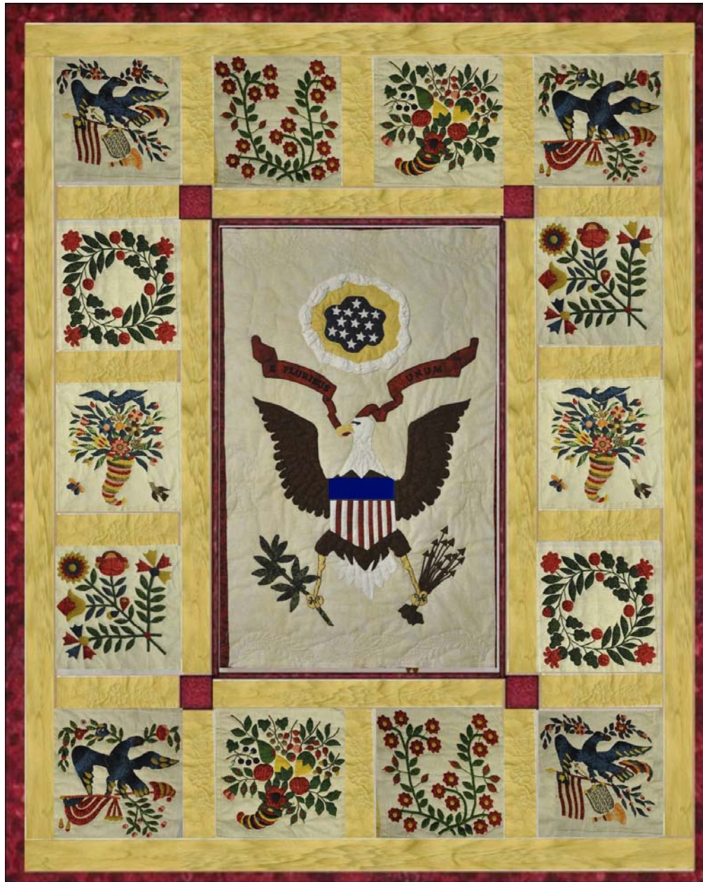
Overall size 67" x 80"

LAST CHANCE TO ORDER YOUR PATRIOTIC QUILT RAFFLE TICKETS!