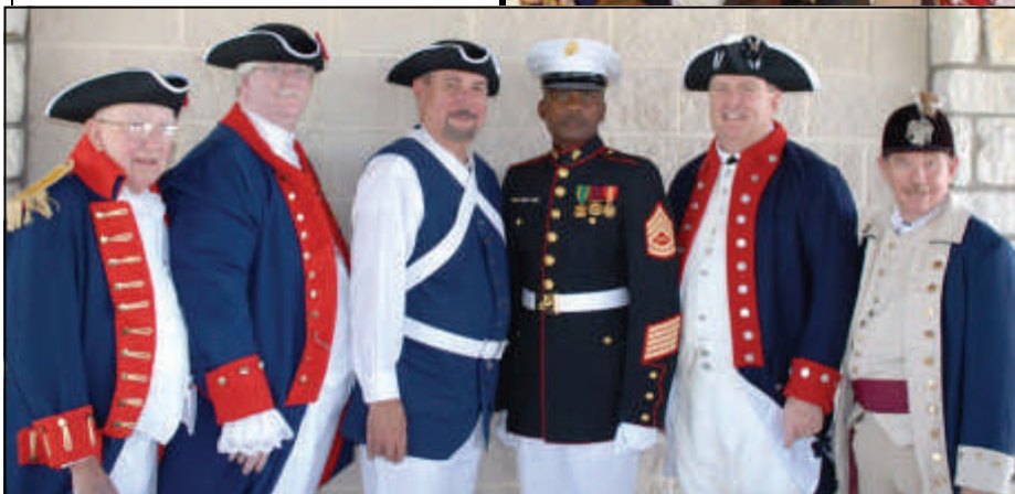
Flag Day, June 14th 2009– Veterans Park, Whitesettlement.

The Van Zandt Chapter Color Guard participated with the local DAR chapters in honoring Flag Day. Several Color Guard members where present.