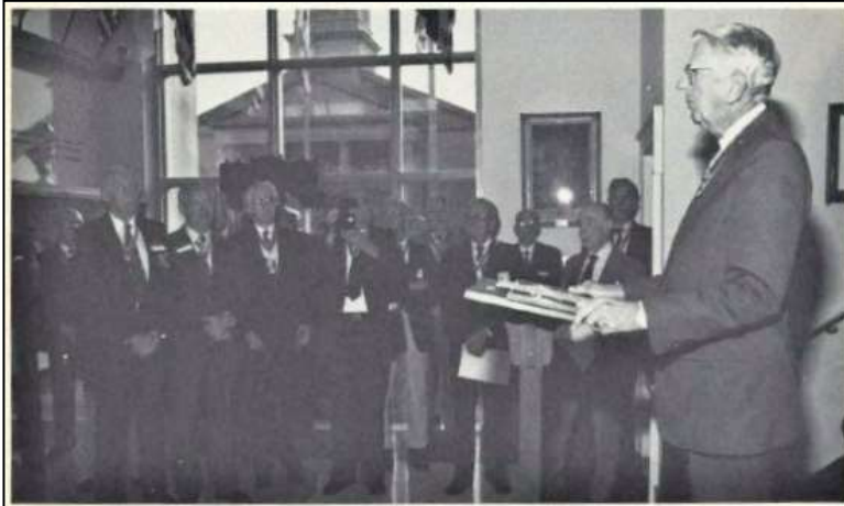
The PG served as Master of Ceremonies for the Trustees Meeting program that saw the dedication of several new paintings, as reported on pages 4 and 5.