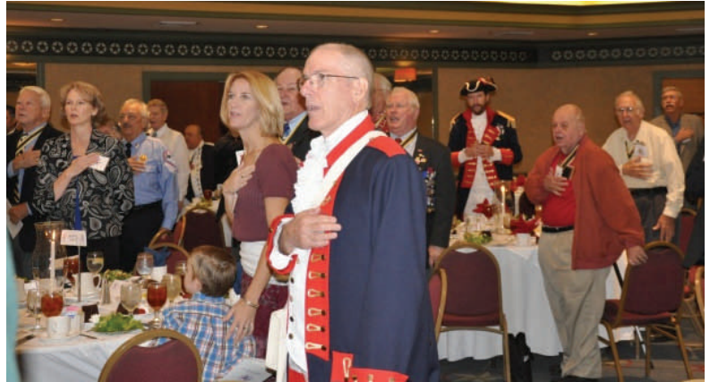
Luncheon Pledge to the US Flag