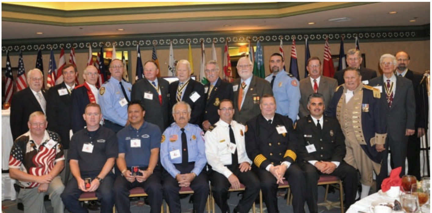
The Saturday luncheon honored area firefighters. Local chapters made their Fire Service Award presentations at lunch.